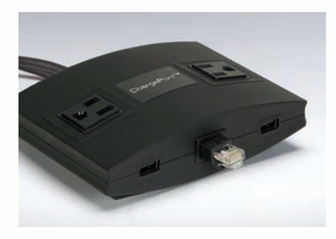
Shown in all black finish with optional Ethernet cable.